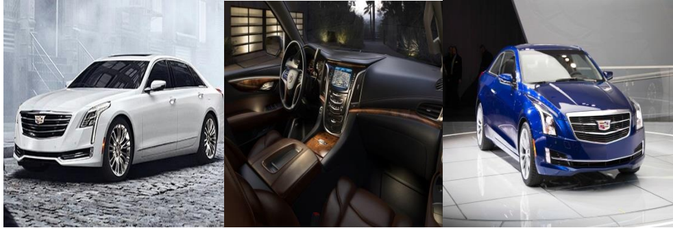
Picture 9. Cadillac cars and interior

mentions in the song are similarly bloated. She indirectly criticizes the society who glorifies this kind of lifestyle.