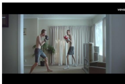
Picture 4. A scene of two boys fighting

The picture above show a medium shot of an empty hall except for the one boy in the centre. The emptiness of the hall suggests that he feels empty and alone inside, or maybe that there is nothing ahead of his future as he looks ahead. In this verse, she mentions “Cadillac, Cristal, Maybach, and diamonds”. Those luxurious and expensive things symbolize the wealth.