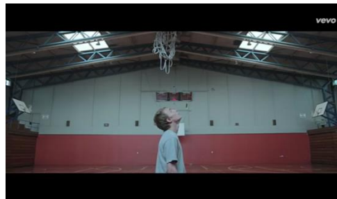
Picture 3. A medium shot of a boy in a sports hall

another line that says “I cut my teeth on wedding rings in the movies”. “To cut your teeth” is a metaphor. To cut your teeth on something means to learn about something. It means that she learns about it in the movies, not in real life.