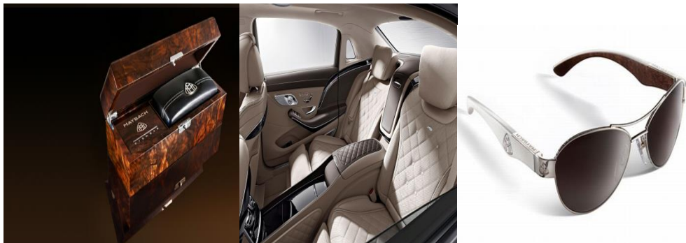
Picture 8. Maybach products

She mentions on material items that are extremely expensive. The pictures above are examples of the expensive wine Cristal that costs $200 per bottle. It is a wine from South America which has been known for its smooth and sweet taste.