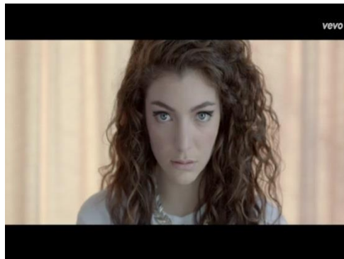
Picture 2. Close-up shot of Lorde

Lorde uses imagery in this song to convey her message. The first line of the song, “I’ve never seen a diamond in the flesh” gives us the image of a person who has never seen diamond in real life. “I cut my teeth on wedding ring” makes us imagine a person who cuts her teeth on wedding ring. Through the line “We count our dollars on the train to the party”, we experience images of people who count their dollars on the train to the party. This also emphasizes the idea of their poverty.