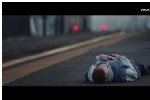
Picture 5. A boy lying beside the train track

can only see a plant, television, and chair. The two boys fighting with each other can be implied that it is something that royals and materialists do, always compete with each other to be the best.