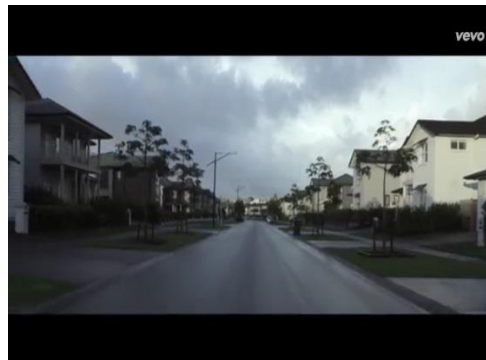
Picture 1. The houses in the music video

The camera shows the scene from a long and landscape shot of the street. The one side of the street is so bright, contrasts with the other side of the street which is darker. This shows the contradiction of two sides of the society, the ordinary or working class of society who live their lives happily and the higher class or the materialists who do not live a happy life because they only focused on material things .