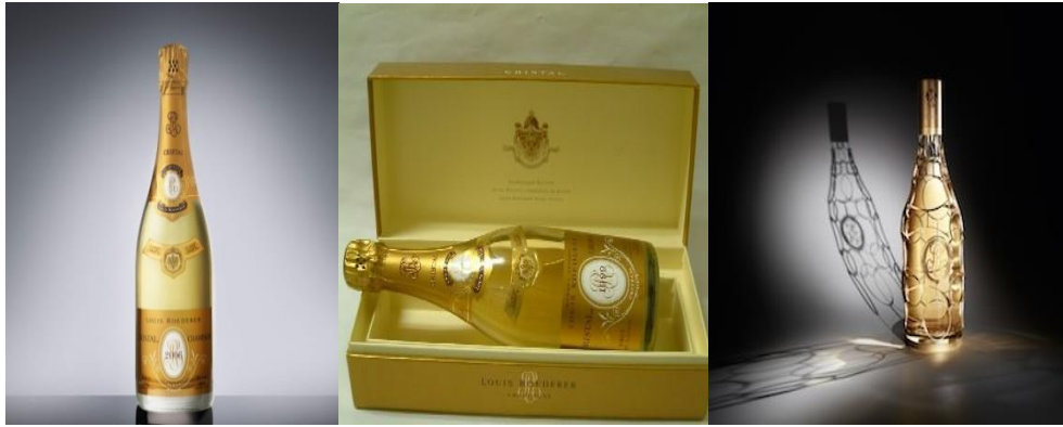
Picture 7. Cristal wines

She mentions on material items that are extremely expensive. The pictures above are examples of the expensive wine Cristal that costs $200 per bottle. It is a wine from South America which has been known for its smooth and sweet taste.