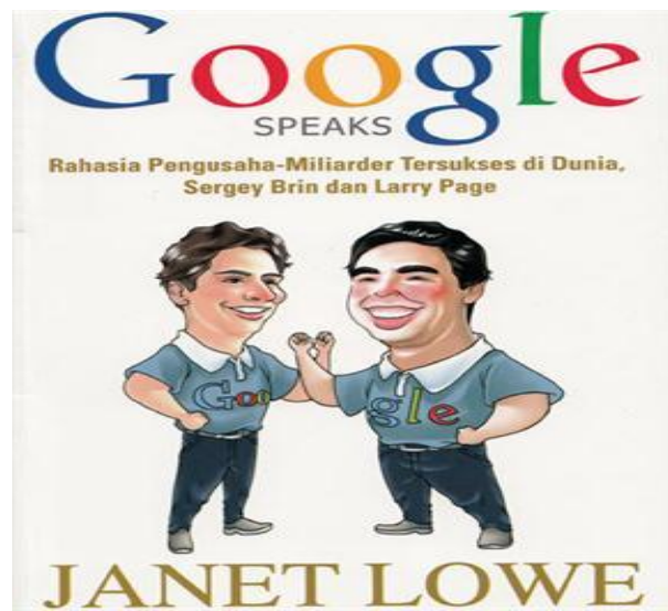
Indonesian Book Cover