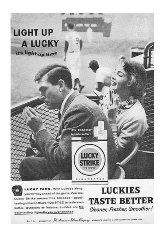
Picture 4.2 An advertisement of Lucky Strike from TV Radio Mirror Magazine Vol. 46 No.1, that was published on 1956

on 1956. Although those advertisements show male figures, the representation of them are different.